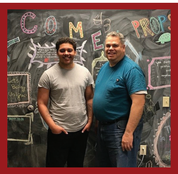
CCS is available to both children and adults and served 1,424 individuals in Dane County in 2019.

Statewide, CCS has been shown to decrease the need for psychiatric hospitalizations and crisis intervention services both during and after the individual's enrollment <sup>[10]</sup>. CCS has also been shown to reduce corrections system involvement, emergency detention, and harm to self and others <sup>[11]</sup>.