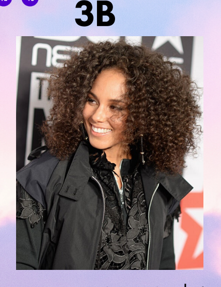
coarse, springy ringlets the circumference of a Sharpie marker