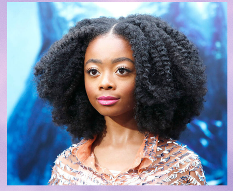
fluffy, cottony, "z" shaped curls; densely packed but still defined