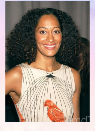
tight, corkscrew coils the circumference of a straw or pencil; strands are densley packed together with lots of natural volume