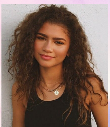
curls the size of