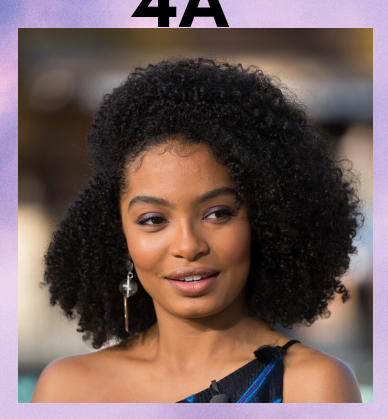
mini, dense, springy, "s" shaped coils the circumference of a crochet needle