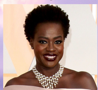
densely packed, tightly coiled, less defined pattern